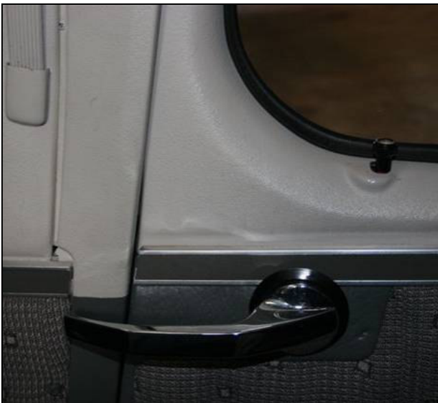
Birdog 373 - C337