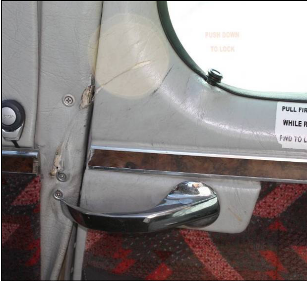
Birdog 366 - Cessna 337