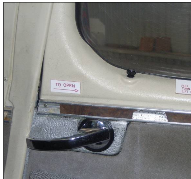
Birdog 369 - Cessna 337